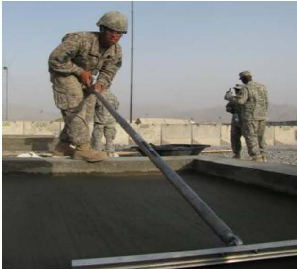
Left: PFC Young (1st PLT) finishes concrete for the BN TOC generator pads