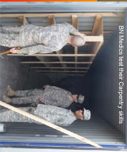
BN Medics test their Carpentry skills