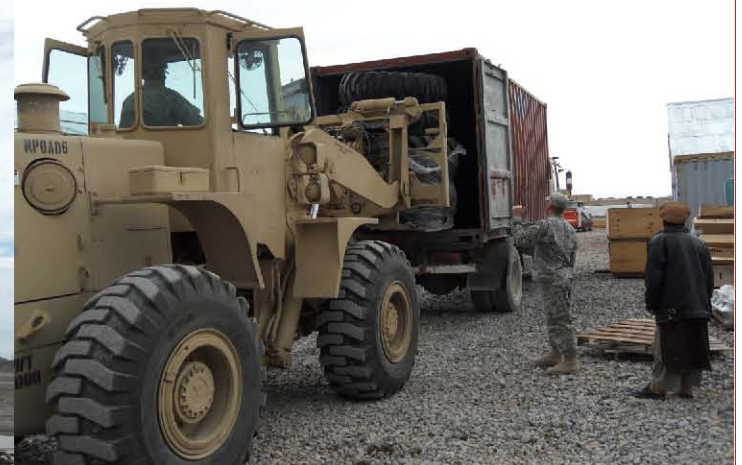
SGT Heiman preparing for an upcoming convoy.