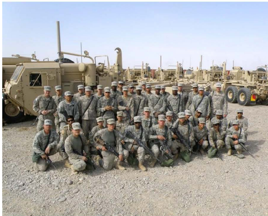
First Platoon plus attachments from Support Platoon after completion of initial bridging operations