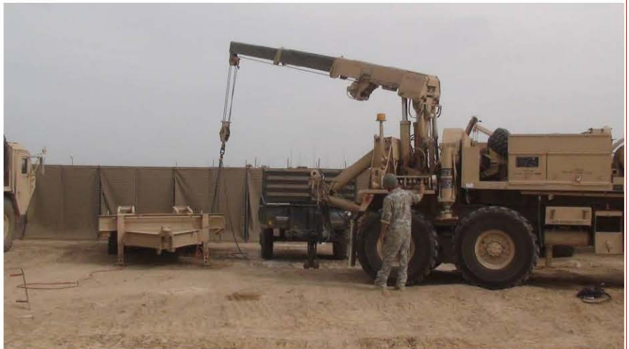
Above: SPC Knoblauch is preparing to fix a trailer