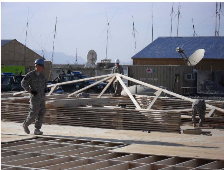
Above: 2nd PLT building trusses for a 50x90 building.