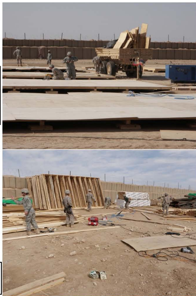
Right: 2 nd PLT sheets tent floors in Life Support Area #3