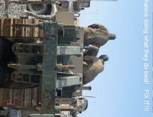
FSC Mechanics doing what they do best: FIX IT!!!