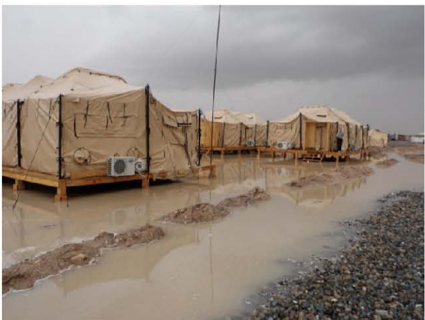
Above: The Company area gets a little taste of the rainy season.