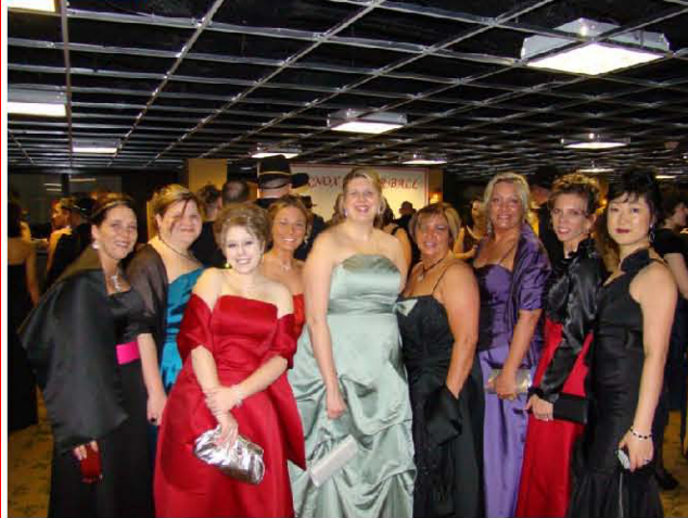
Seahorse Ladies at the Armor Ball 2010