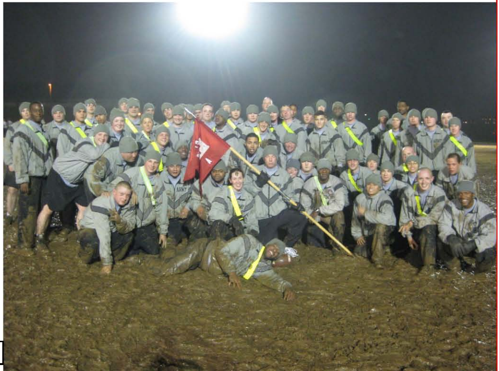
Right: Mud Bowl 2010