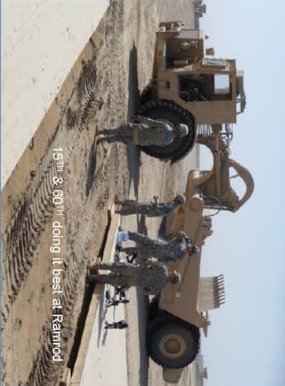
15 TH & 60 TH doing it best at Ramrod