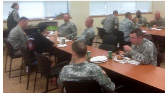
Soldiers from the 19th EN BN Rear-D and the 502nd Bridge Company gather together for good food and fellowship in the BN classroom for an FRG event.

★ www.nacrra.org/MilitaryPrograms/army.php