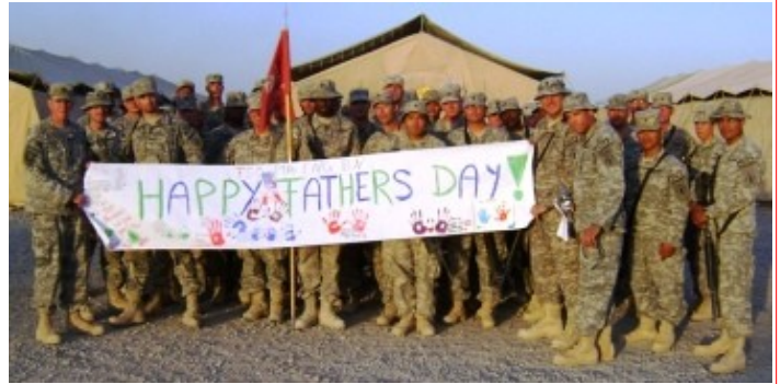
The Reinforcers gather for a heart-warming message on Father's Day in front of the barracks in South Park.