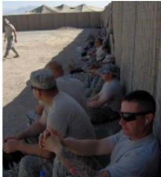
Top: 1 st Platoon members taking a much deserved break from the sun shaded by a line of Hesco baskets.