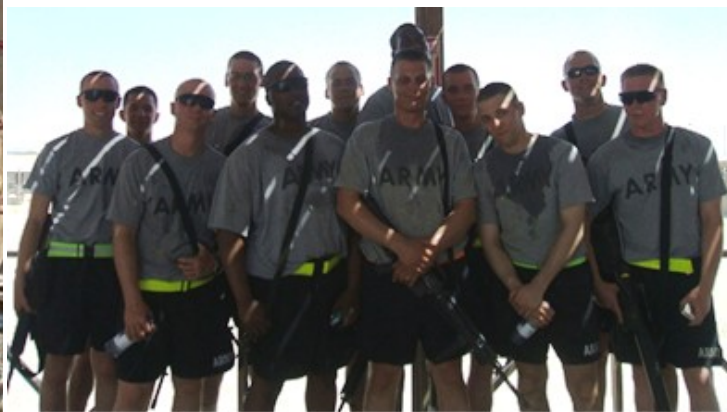
Left: HQ Soldiers and platoon leaders gather on the Boardwalk at KAF after a game of ultimate frisbee.