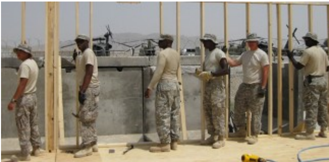
Left: 2 nd Platoon Soldiers raising one wall of their 40'x50' building.