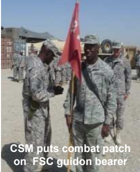
CSM puts combat patch on FSC guidon bearer