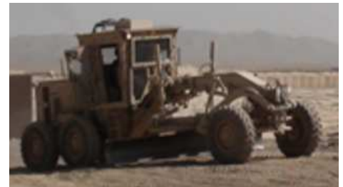
Above: CPL Martinez finish grades the guard tower site using the road grader.