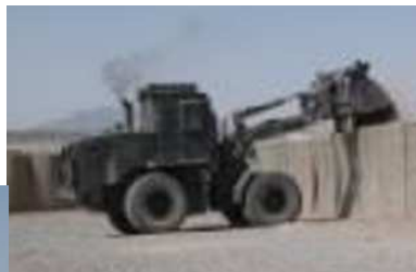
Above: 2-15th EN CO uses the bucket loader to fill Hescos at the artillery firing point on the FOB.