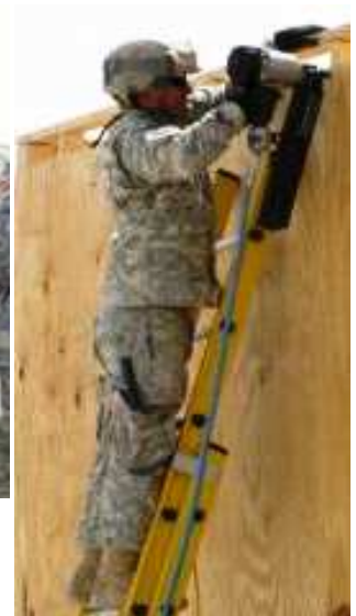
Above: A Soldier from I-60th EN CO nails plywood to the exterior wall of the TOC.