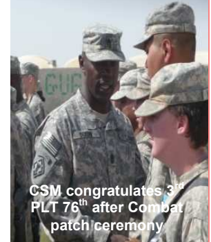
CSM congratulates 3 rd PLT 76 th after Combat patch ceremony