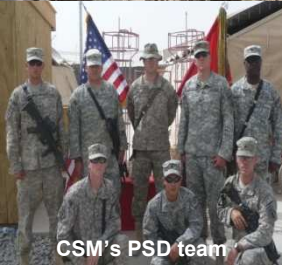
CSM's PSD team

Seahorse Families!!! I know we have some of the greatest families in the world. I will bet this against any Army family team in the world. Life here in the big sandbox is getting better; this is evident with mail delivery, more dining facilities, more internet connections, more phones and more care packages from different organizations around the United States. Your Soldiers are busting their butts making a difference here in theater. Everywhere the boss and I visit, all we hear is how much of an impact your Soldiers are making. It's nice to hear from others of how great and wonderful your Soldiers are performing. I am not telling you anything you don't already know about your Soldier. I travel to every destination where your Soldier lay his/her hat. Living conditions are better for some than others; we are desperately fighting day in and day out to make life better. This month I will not talk as much, I will share with you some photos of my trips to each location. Command Sergeant Major's Advice: No matter what, the morale is still high. Please remember, our success over here is partially dependent on you back there. Please continue to write your Soldiers, send emails/cards, goodies, and constantly remind them of how much you support and appreciate what they are doing. This is MOTIVATION to the highest degree. CSM's word of the month: BELIEF