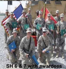
SH 6 & 7 with awardees