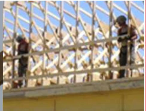
Above: Two Soldiers brace trusses on the Med Annex roof project on KAF.