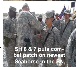
SH 6 & 7 puts combat patch on newest Seahorse in the BN