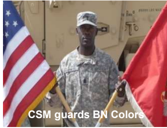
CSM guards BN Colors