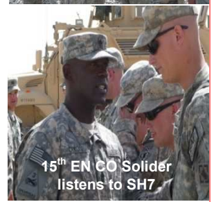
15 th EN CO Soldier listens to SH7