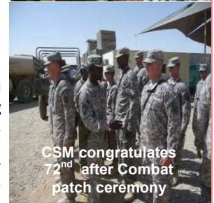
CSM congratulates 72 nd after Combat patch ceremony

Seahorse Families!!! I know we have some of the greatest families in the world. I will bet this against any Army family team in the world. Life here in the big sandbox is getting better; this is evident with mail delivery, more dining facilities, more internet connections, more phones and more care packages from different organizations around the United States. Your Soldiers are busting their butts making a difference here in theater. Everywhere the boss and I visit, all we hear is how much of an impact your Soldiers are making. It's nice to hear from others of how great and wonderful your Soldiers are performing. I am not telling you anything you don't already know about your Soldier. I travel to every destination where your Soldier lay his/her hat. Living conditions are better for some than others; we are desperately fighting day in and day out to make life better. This month I will not talk as much, I will share with you some photos of my trips to each location. Command Sergeant Major's Advice: No matter what, the morale is still high. Please remember, our success over here is partially dependent on you back there. Please continue to write your Soldiers, send emails/cards, goodies, and constantly remind them of how much you support and appreciate what they are doing. This is MOTIVATION to the highest degree. CSM's word of the month: BELIEF