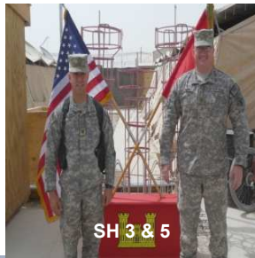
SH 3 & 5