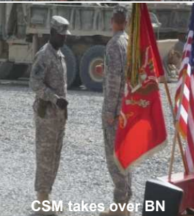
CSM takes over BN