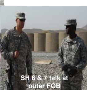
SH 6 & 7 talk at outer FOB