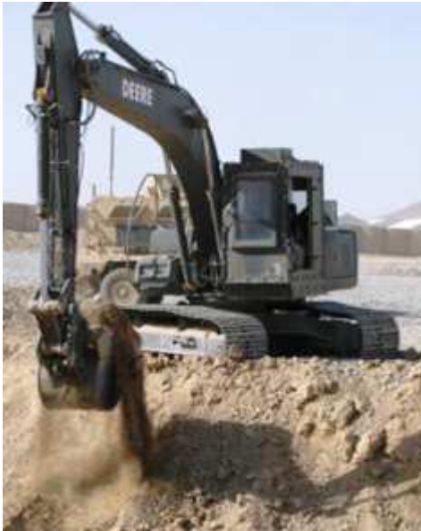
Above: A Soldier from 2-15th EN CO excavates dirt from the burn pit using the HYEX, or hydraulic excavator. The burn pit will be used to dispose of waste.