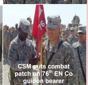
CSM puts combat patch on 76 th EN CO guidon bearer