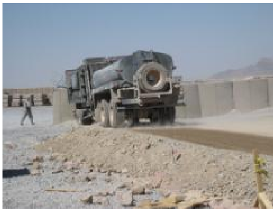
Left: 2nd PLT sprays water on the relocatable building (RLB) pad to prepare it for compaction. Soldiers will move into RLBs once the pads are done and the RLBs are erected.