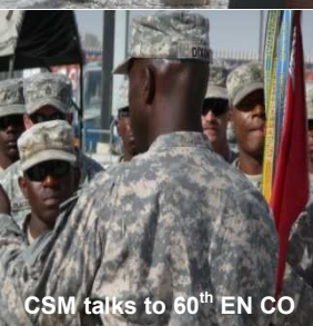
CSM talks to 60 th EN CO