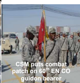
CSM puts combat patch on 60 th EN CO guidon bearer